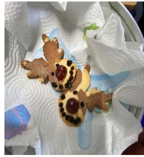
Reuben - FW