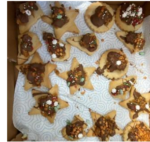
Freddie - 4W