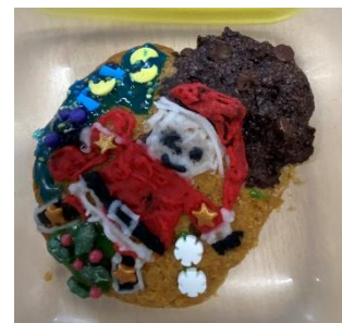
Oliva 2C - OVERALL WINNER