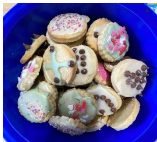
Anya - 5H/Sidney 3H