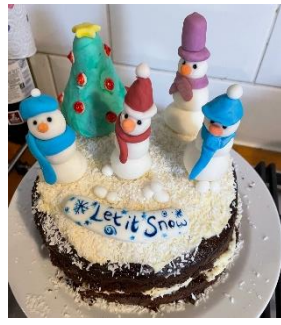
Max - FS