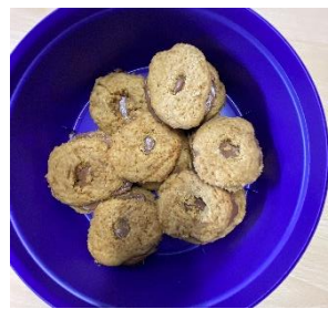
Annabel - 6G