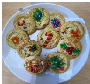
Noah - 3T