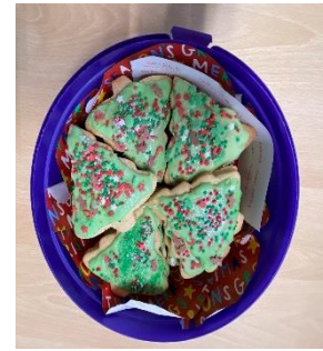
Eddie - 1S