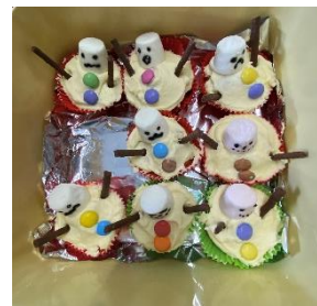
Edward - 4W