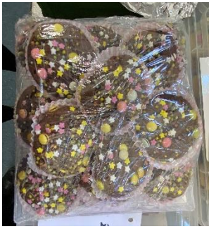
Esila - Nursery